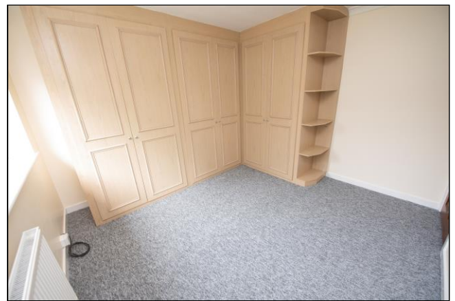
BEDROOM 3 9'3" (2.82m) x 8' (2.44m) Radiator