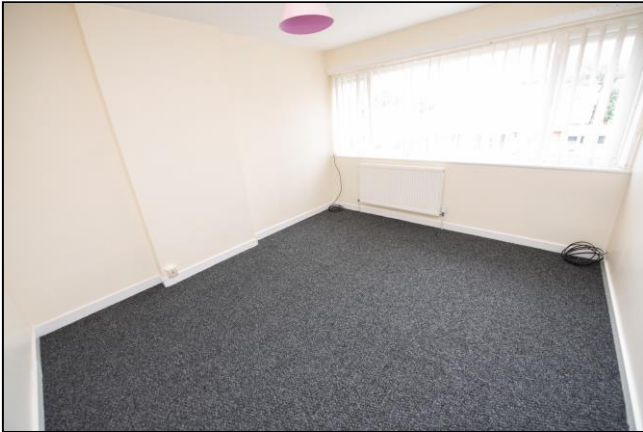
BEDROOM 1 13'9" (4.19m) x 12'7" (3.84m) Vertical blind, radiator